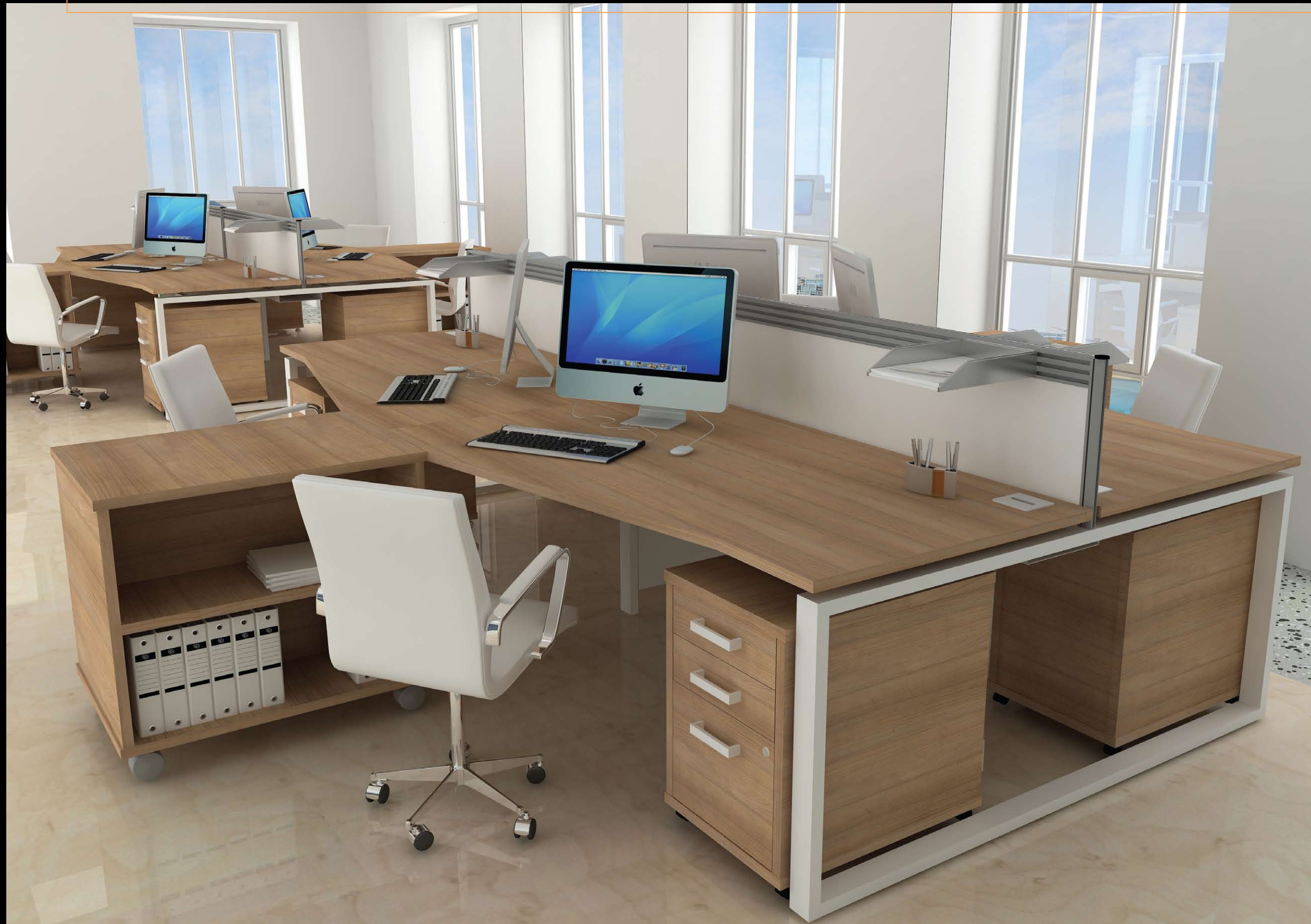
Tall storage with open top section

Refreshing and creative storage designs enable the user to create configurations maximising workspace. Polaris XT screens enhance working practices with the addition of screen filing accessories.