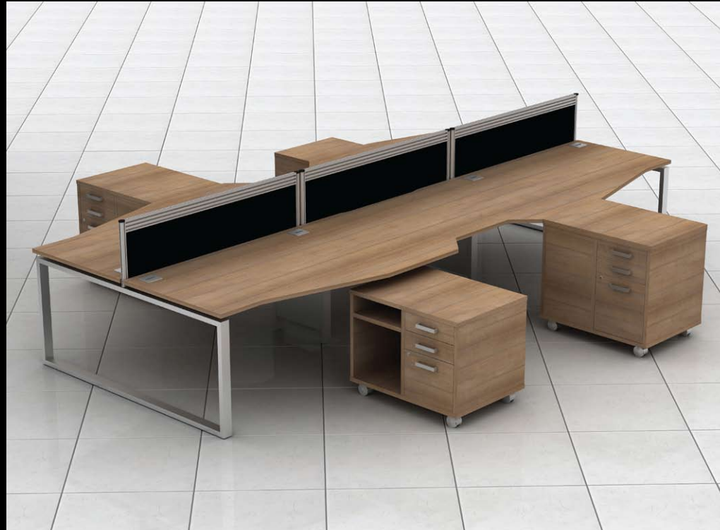
cluster showing fixed and sliding tops

Ibench is available with four desktop footprints:- Rectangular Single Wave Double Wave Radial