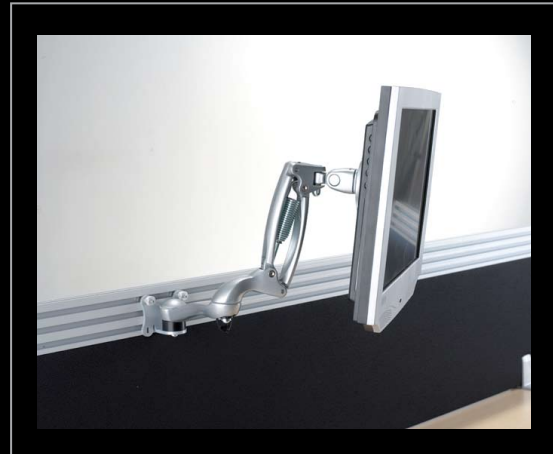
Screen mounted monitor arm

Double sided storage solutions and pedestals offer maximum flexibility without compromising office workspace.