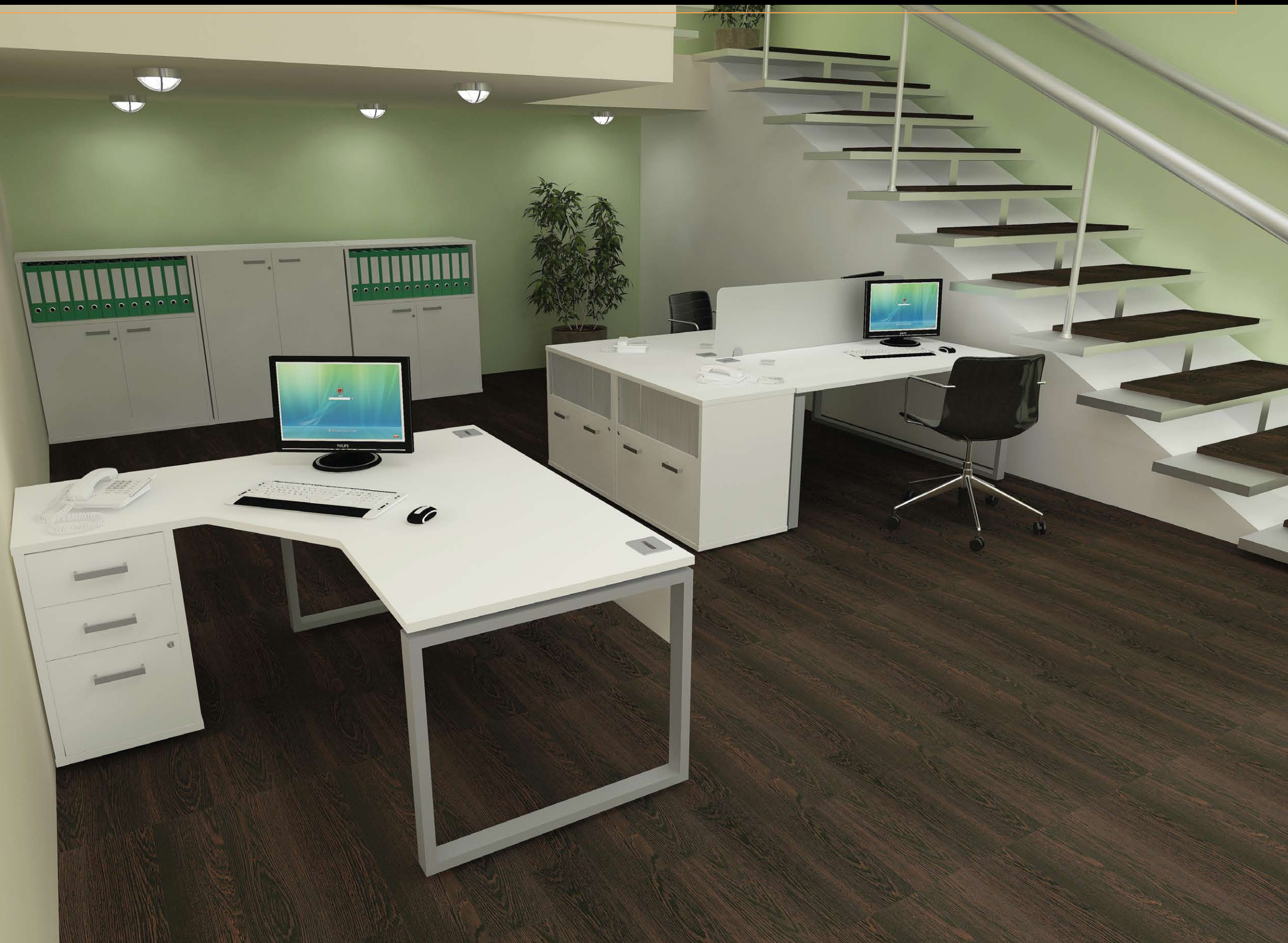
Side filer drawer with lockable tambour top section

Sliding desktops provide an efficient cable management solution with the use of easily accessible cable trays located centrally between workstations.