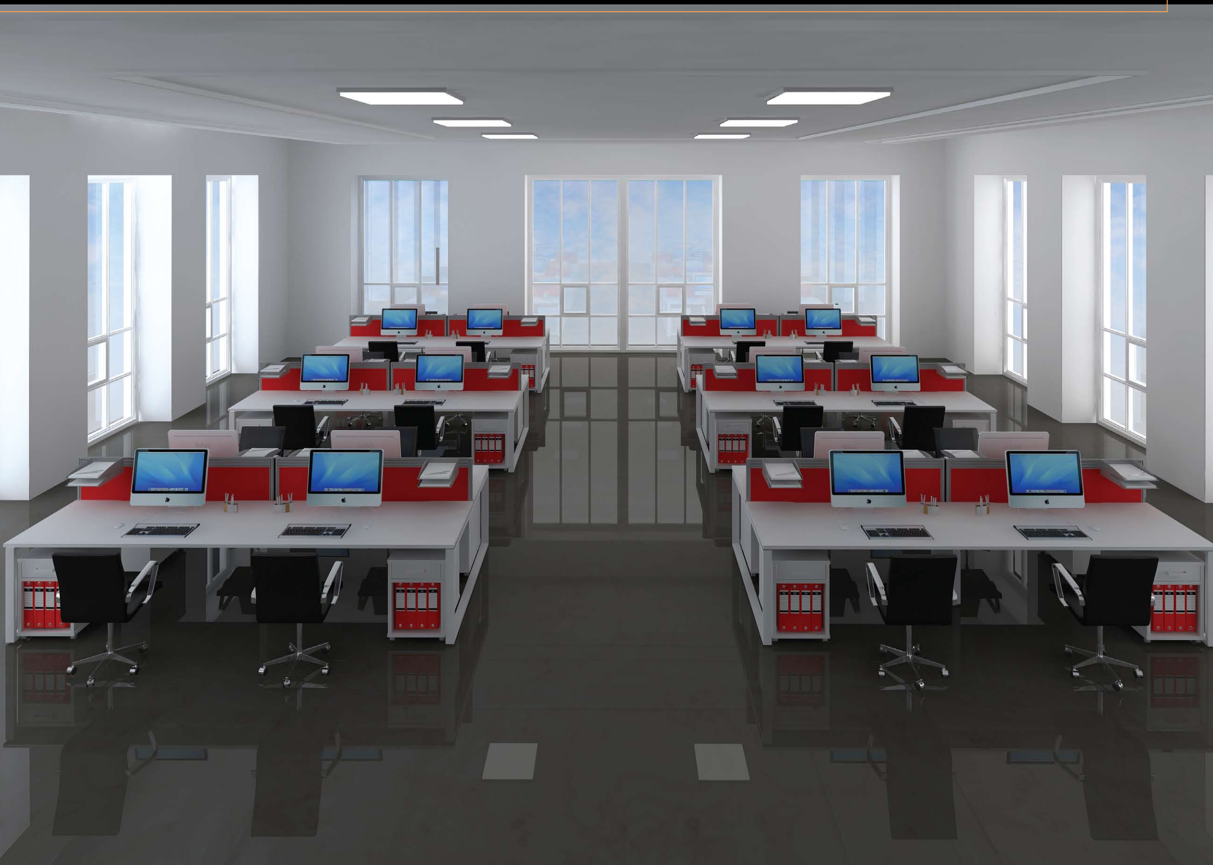
Mobile pedestal with open section

Configurations using four desks accompanied by polaris xt screens and single drawer pedestals complete the ideal bench footprint.