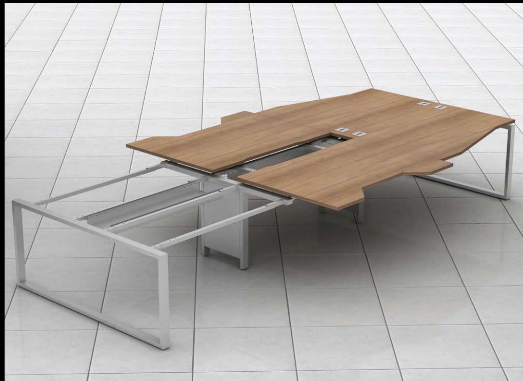
cluster showing underframe and desktops in sliding position

Fixed and sliding desktops can be incorporated into the same desking cluster as well as various desktop shapes.