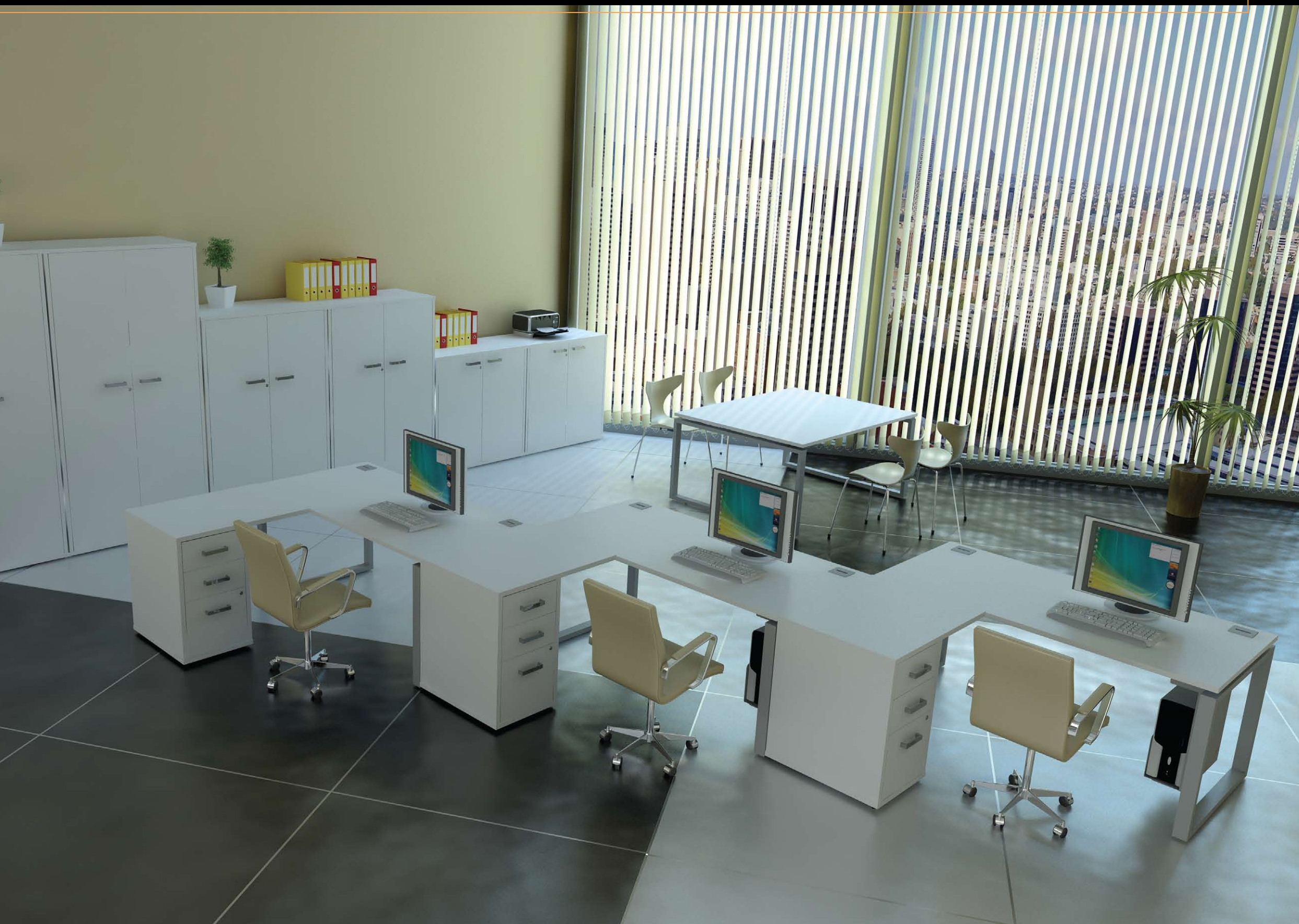
Frame mounted CPU holder

Return storage units can be used to maximise working area providing the user with complete functionality.