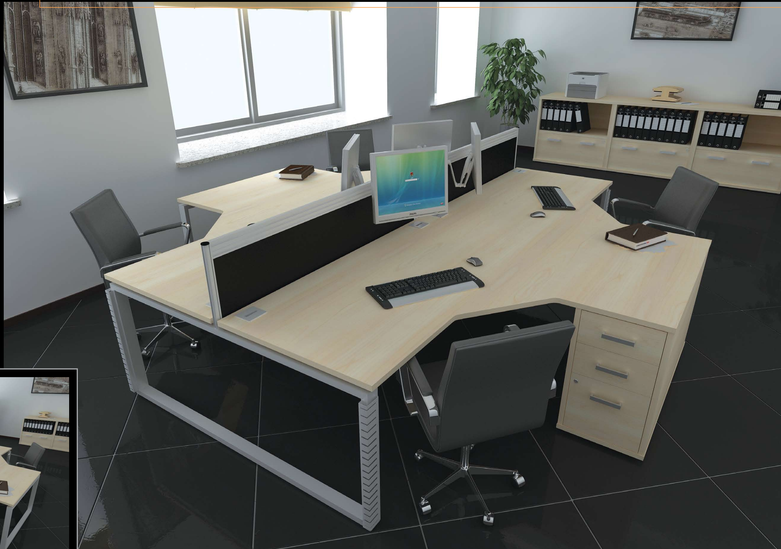
Radial cluster with return hoop leg

Combination radial bench desking incorporating integrated desk-high pedestals when configured in a four-desk cluster provides an affordable and cost effective solution due to the leg sharing components. Stylish cable management is designed to carry unsightly cabling with the use of single and double cable trays and vertical cable risers.