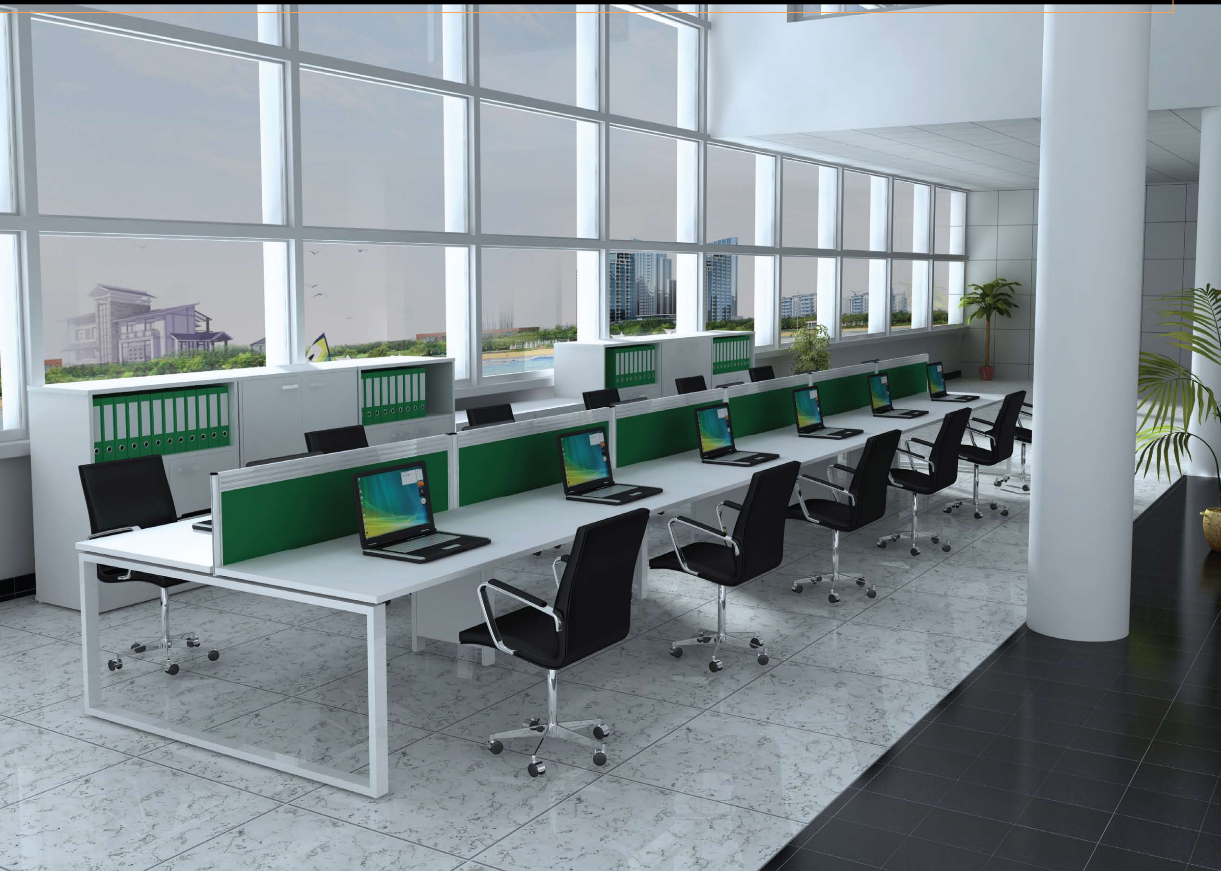
Cable management riser option

Introducing ibench, the latest design from Imperial Office Furniture. Designed with leg sharing flexibility and a clean, innovative leg design, ibench is the ideal product for the modern day office.